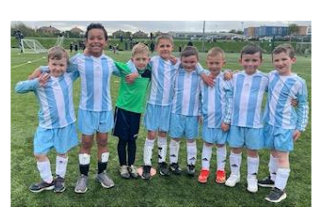
KS1 Boys football Team